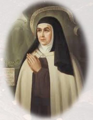
St Teresa of Avila (1515-1582)

Christ has no body now on earth but yours.