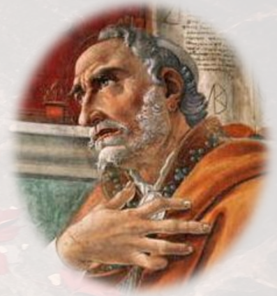
St Augustine of Hippo (354-430)

and the Sovereign Lord of all your works, blessed for evermore.