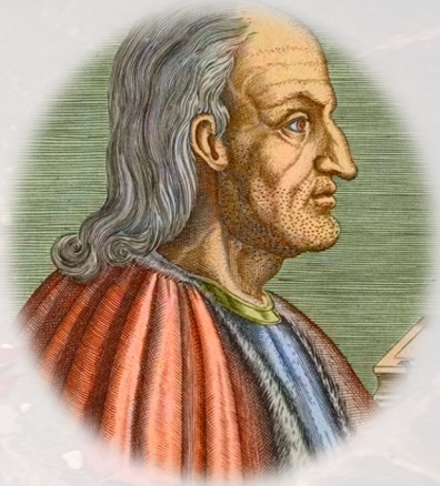
St Anselm of Canterbury (1033-1104)

Come now, my child. Flee for a while from your tasks, hide yourself for a little space from the turmoil of your thoughts. Come, cast aside your burdensome cares and put aside your laborious pursuits. For a little while, give your time to God and rest in him for a little while. Enter into the chamber of your mind, shut out all things save God and whatever may aid you in seeking God; and, having barred the door of your chamber, seek him.