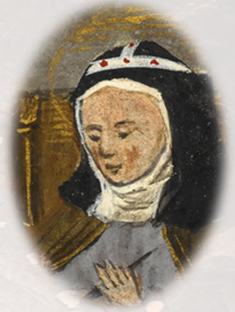
Margery Kempe Christian Mystic (c. 1373 – c. 1440)

If you said the Lord's Prayer a thousand times a day, it would not make me as glad as when you remain silent and let me speak to you.